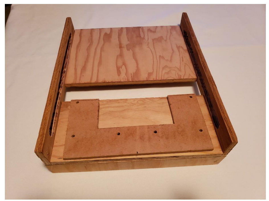
Figure 3: New wooden prototype - top view