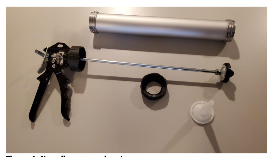
Figure 4: New dispenser subsystem