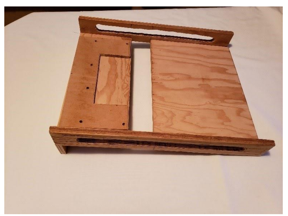
Figure 2: New wooden prototype - side view